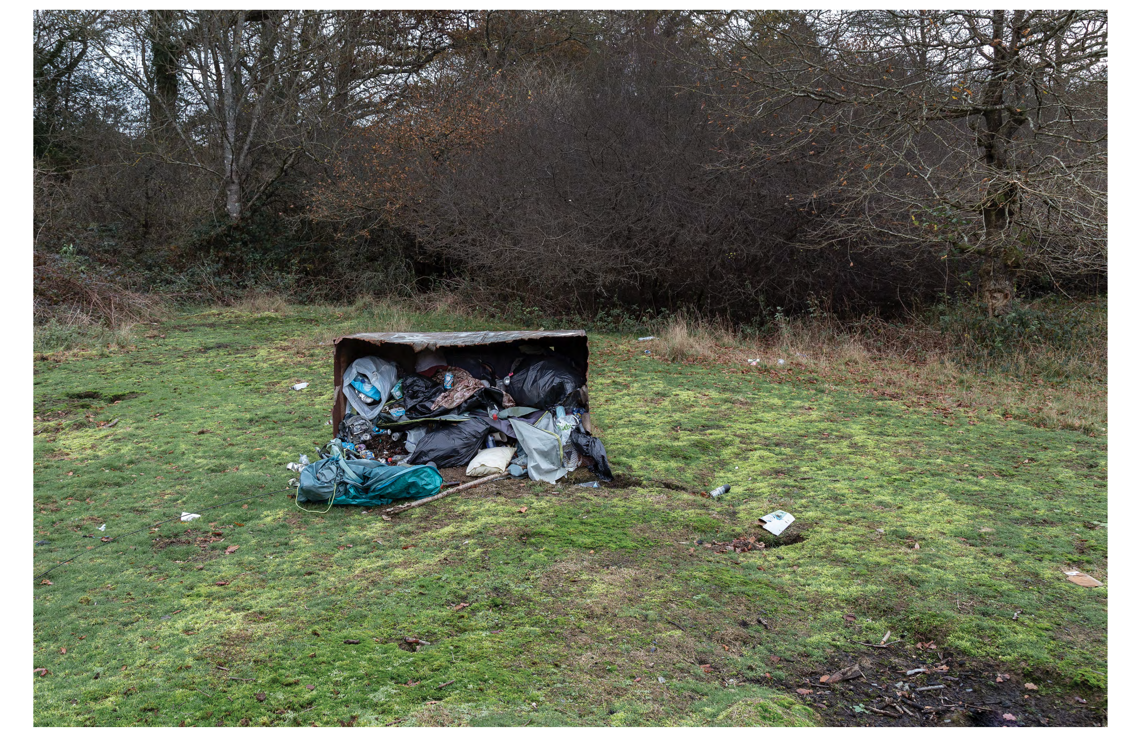
Rubbish discarded in a rewilded area full of wildlife. Dormansland, Surrey.