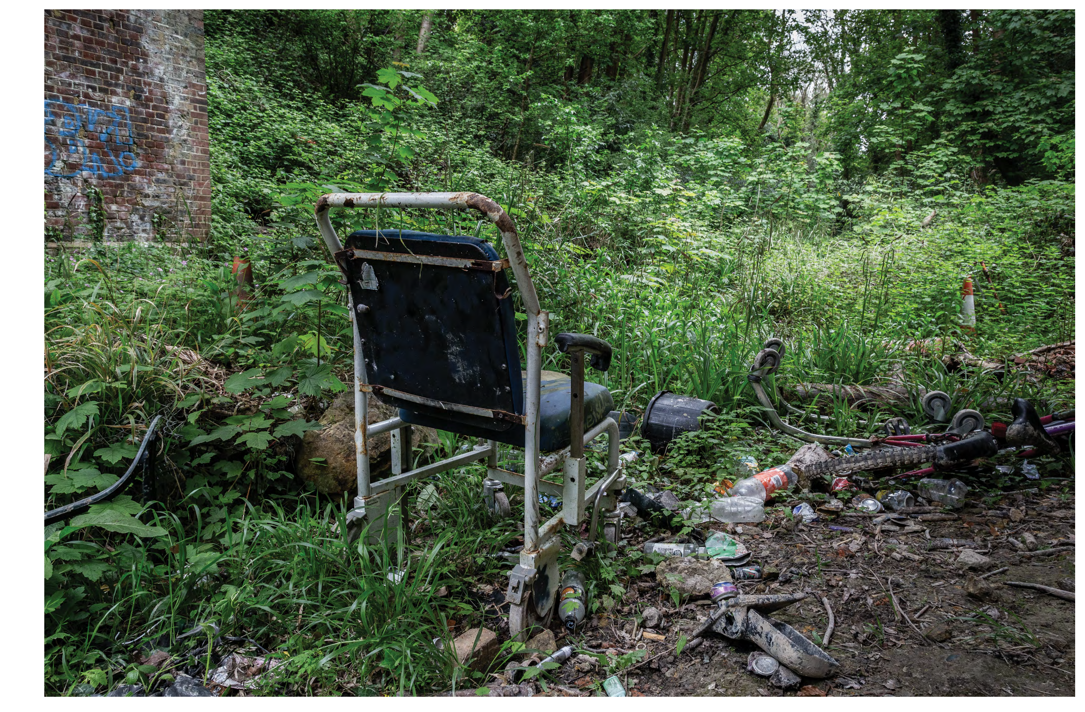
Hardly anyone visits this disused railway cutting but still the rubbish piles up. East Grinstead, West Sussex.