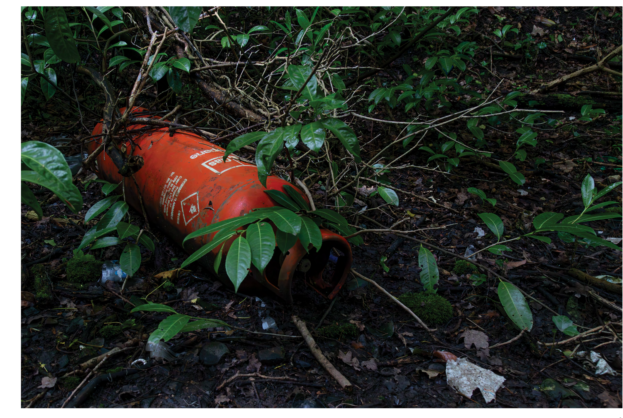
This propane gas bottle was disposed of by rolling it down a hill. East Grinstead, West Sussex.