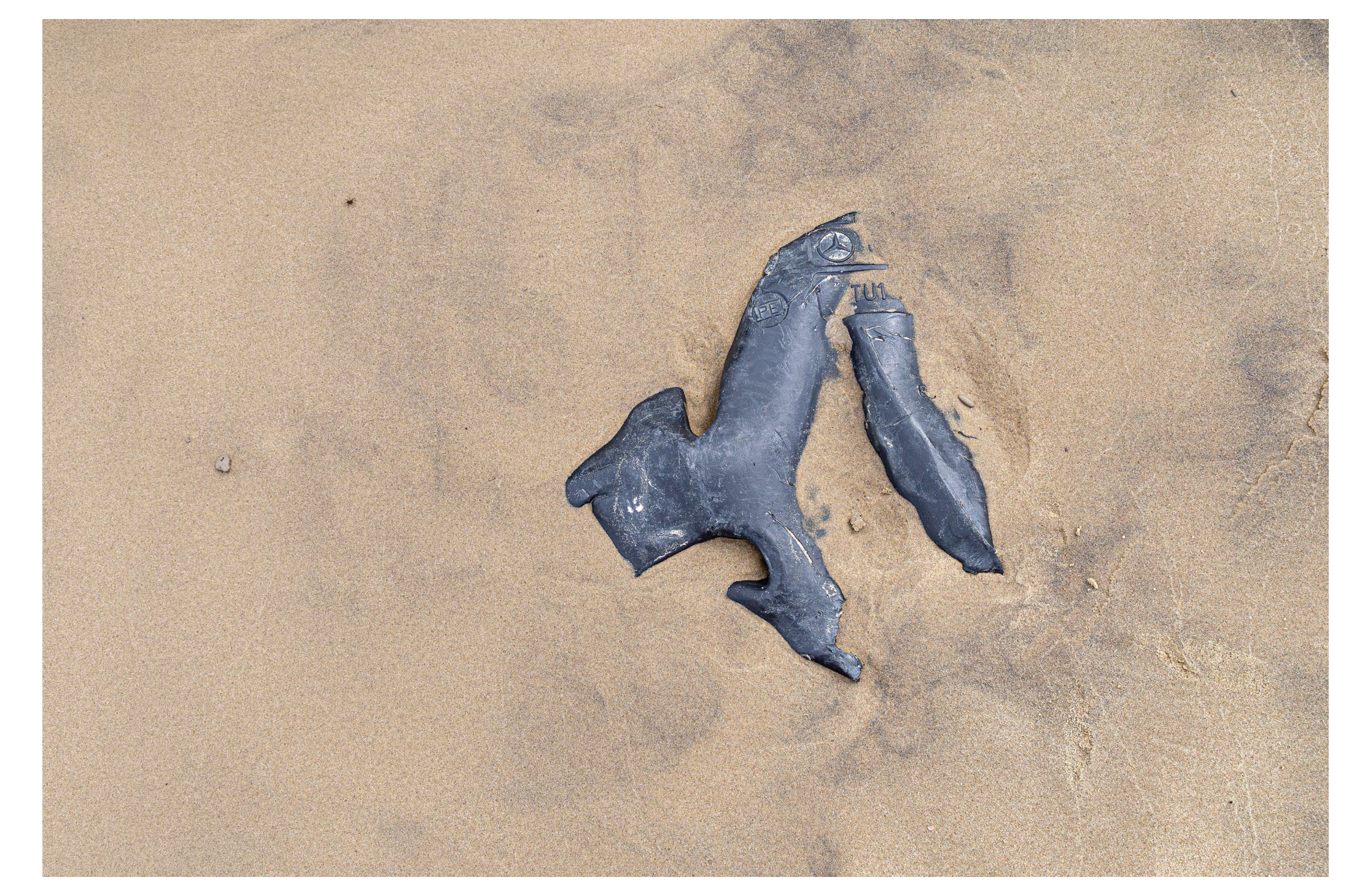
Part of a Mercedes car. River Thames, Kent.