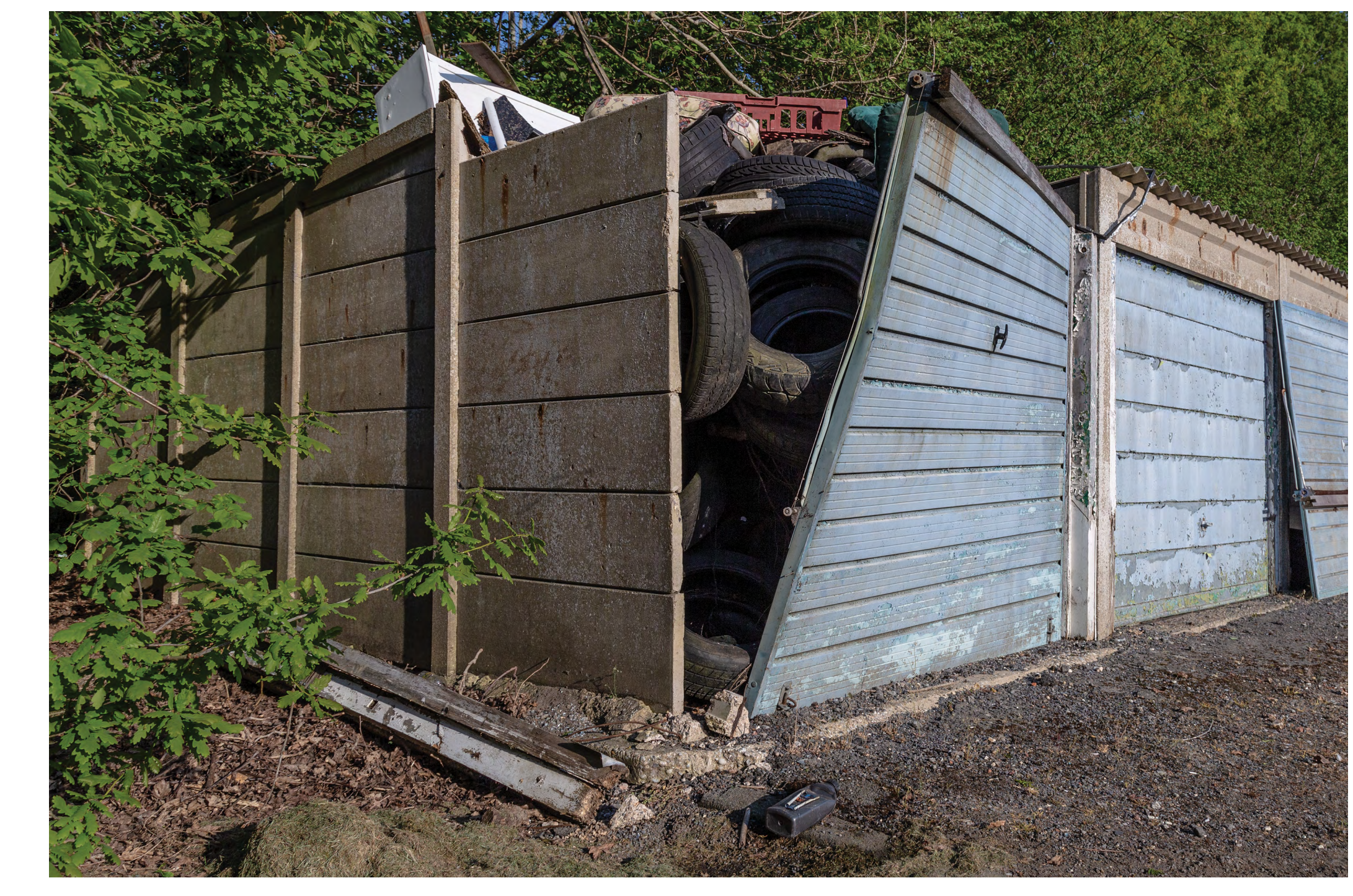
This garage has been destroyed by the rubbish crammed into it. East Grinstead, West Sussex.